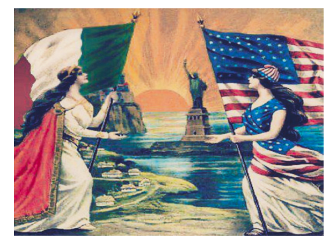
Italian-American Friendship Poster